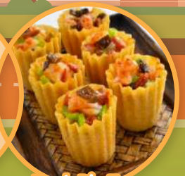
Kueh Pie Tee

Join Us for Snacks, Drinks, Art & Craft Activities and Lion Dance Performance too. Admission is Free!