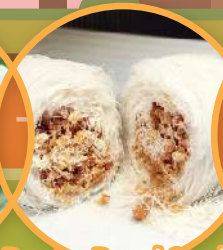
Dragon Beard Candy