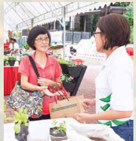
The hundreds who attended the tree-planting activities that day learned many things about how to grow greens in small spaces.