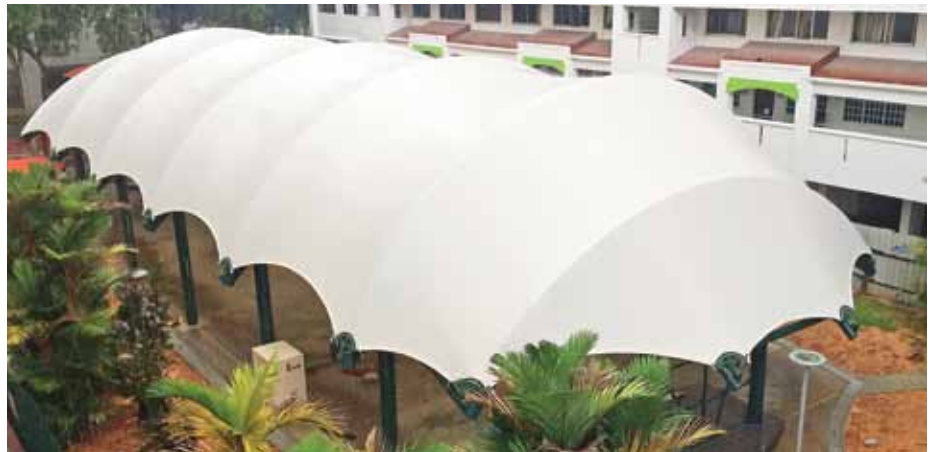
The Marquee @ HG St 51 at Blk 537 Hougang St 52 (top) and the Marquee @Palmview at Blk 555 Hougang St 51 (below).

Part of the feedback before the NRP for the Palmview estate was requests for sheltered places for events. Going one better, the architects designed these shelters to be event areas as well as drop-off porches and covered linkways!