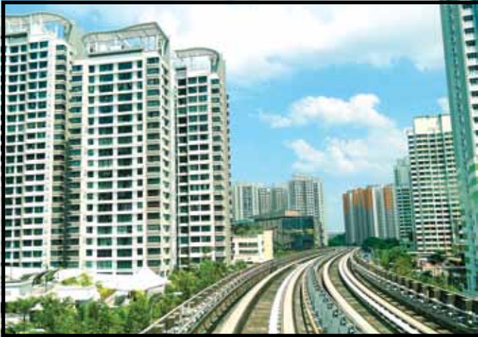
"My children's favourite view from the LRT" by Loo Betsy (Sengkang West)