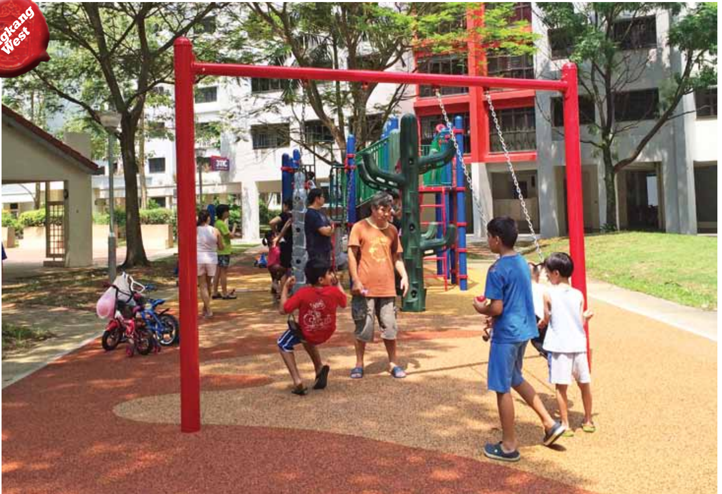
For better play, playgrounds at 312A Anchorvale Road (top) and Blk 925 Hougang Ave 9 (bottom left) were completed in October.