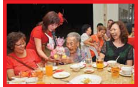
Prizes were given to the oldest resident...