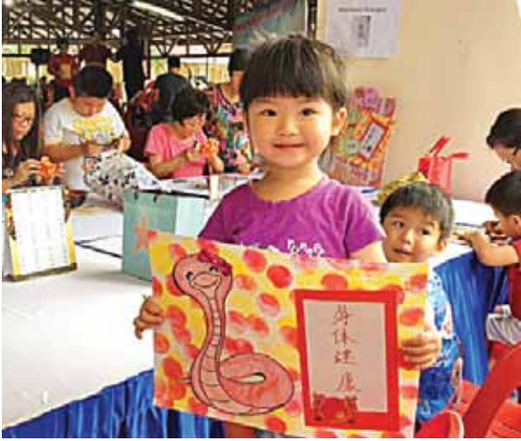
The largest multi-purpose hall in the AMK-Hougang division, 648A Hougang Avenue 8 sees plenty of use through the year. The Arts and Culture Club also organises an arts performance on the last Sunday of each month.

B anquets. Weddings. Wakes. Block parties. Festive celebrations of every kind. Exhibitions. Tournaments. You've probably seen the many multi-purpose halls across our town put to all these uses and then some.