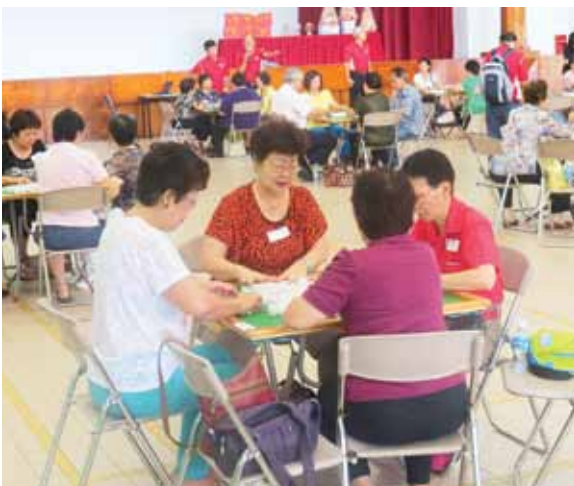
What you see here is an Active Agers Mahjong Mind Game, hosted at the Kebun Baru CC Hall. Seniors from all across our town gathered to play old friends and make new ones.

All you need to book a hall is to be a resident of our town. Visit any Town Council office (or CC if that's where you want to book) with your IC to get started!