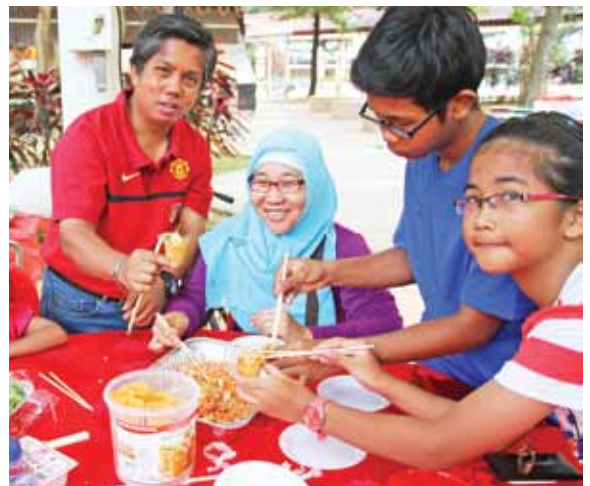
Bringing people from all walks of life together under one roof, the hall at Block 424A Ang Mo Kio Street 42 hosted a Chinese New Year get-together recently. There was singing, food and many a huat ah.