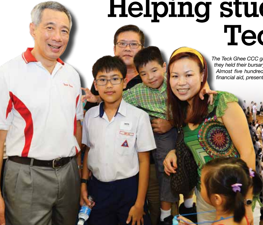
The Teck Ghee CCC gave our students a great start to the year when they held their bursary ceremonies at Townsville Primary in January. Almost five hundred students from low-income families received financial aid, presented by PM Lee Hsien Loong.