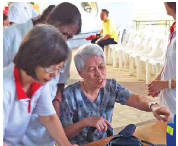
The hall at Block 439 Sengkang West Avenue is used for everything from health checkups to Chinese New Year gatherings. And quite often, a quick game of badminton, out of the afternoon sun.