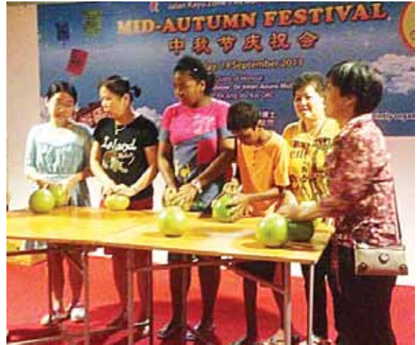
The hall at Block 985 Buangkok Crescent has been host to weddings, wakes, a job fair – and even a pomelo peeling contest during the Mid-Autumn Festival. Oh, the stories it could tell.