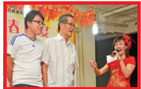
...and the tallest, for which these two almost tied!