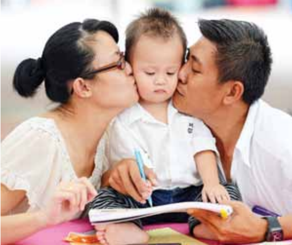
At our halls, people come together as friends. The Teck Ghee CC Hall took it a step further and brought families together – just about a hundred in all – for Baby Singapore 2013.