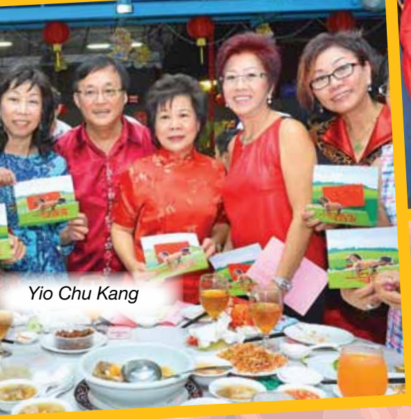
Yio Chu Kang

我们大规模庆祝马年的到来，举办了多场晚宴，互相道贺新春快乐，马到成功。当然，晚宴少不了捞鱼生，祝愿大家捞得风生水起。