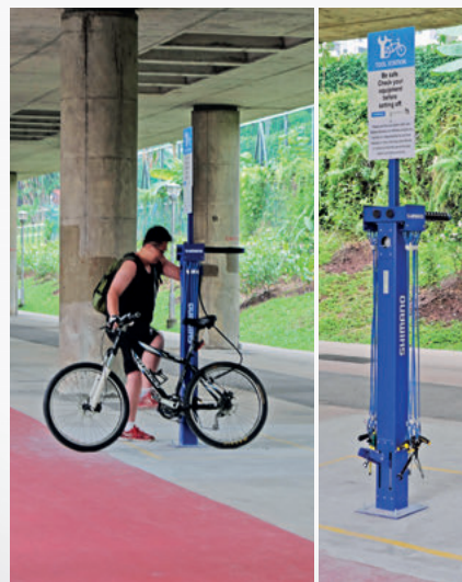
Bicycle self-service station with a tyre pump and basic bike maintenance tools