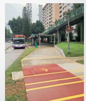
Pedestrian priority zones at bus stops

Is your device okay for use on pavements? Check out the table below.