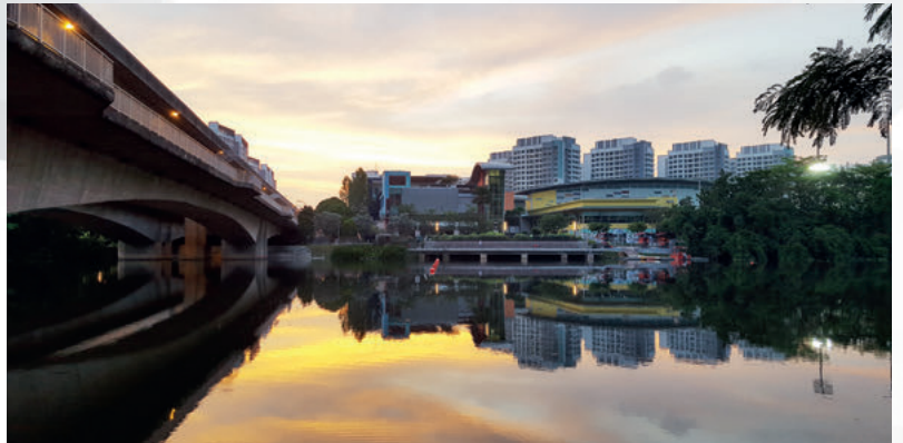
Beautiful Sengkang River.