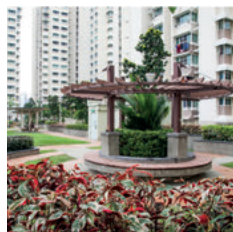
P06 High-rise havens of green