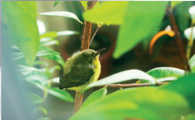
A baby sunbird dozing off on my plant at the corridor of my HDB flat.

Please e-mail your entries together with your name, address, NRIC number and contact number to feedback@amktc.org.sg .