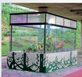
Terrarium showcasing plants found in a tropical rainforest