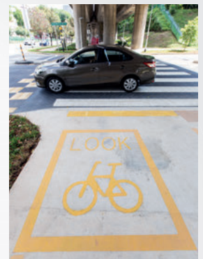
Yellow road markings enhance the safety of cyclists and pedestrians