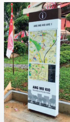
Map boards giving directions to nearby amenities