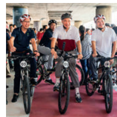
P12 Paving the way to being car-lite