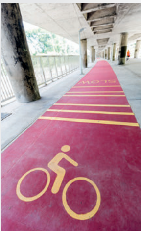
Cycling ramps with slow-down rumble strips

Here is a look at the features of the completed Phase 1: