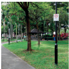
P04 Smoke-free parks