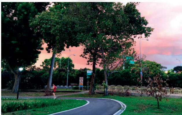
Beautiful sunset at the park at Ang Mo Kio Avenue 10.