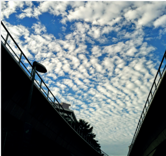
Ang Mo Kio MRT in the morning.