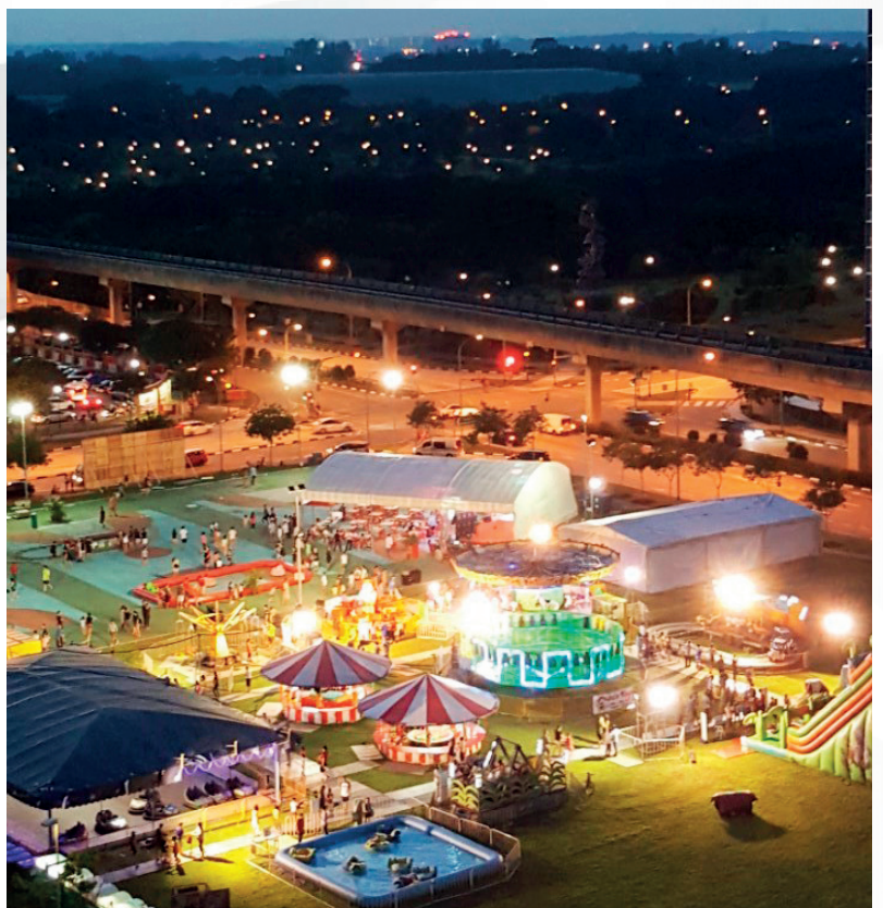
What a wonderful, magical and vibrant night in Anchorvale!